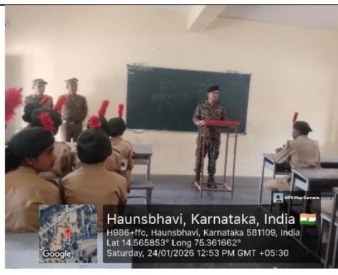
CO Sir Interacting with Cadets