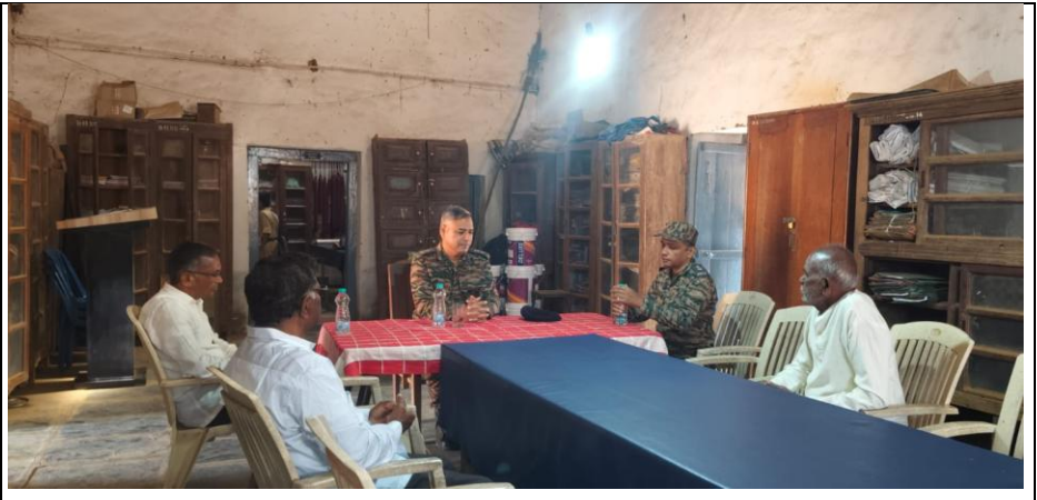
CO and AO Sir Discussion in DHS with Headmaster and Staff