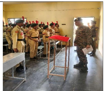
Interacting with Cadets