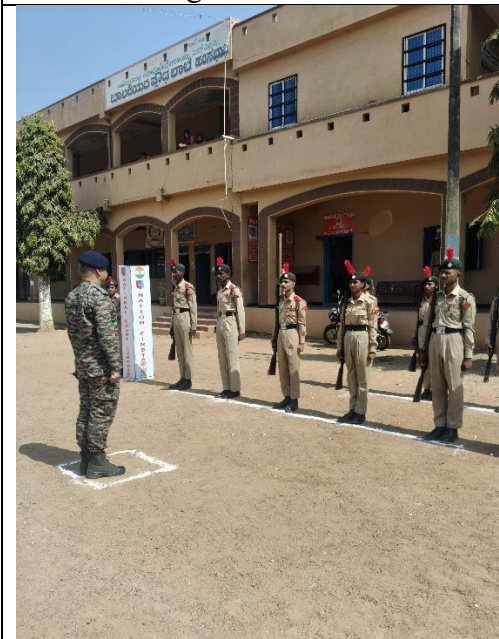
Receiving Guard of Honour