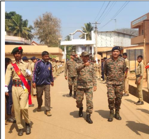
Arriving CO and AO Sir