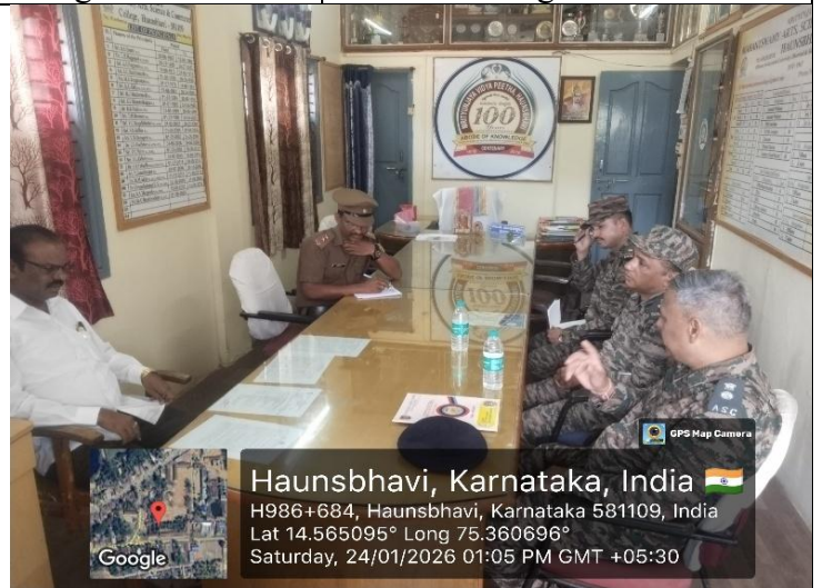
CO and AO Sir Interacting with Principal (MASC College)